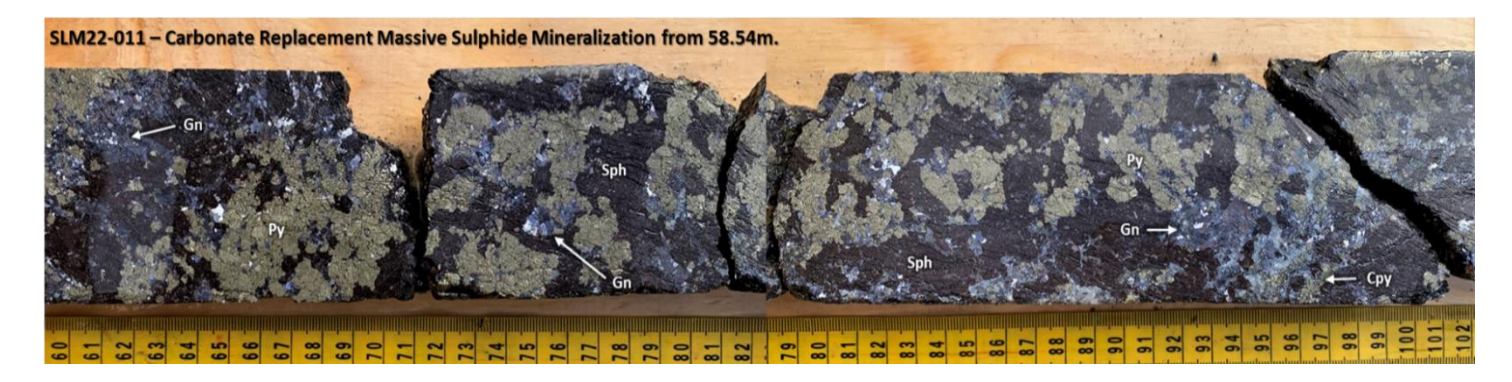
Figure 1: Massive CRD sulphide intercept from Hole SLM22-011 at the Grizzly Ag-Zn-Pb-Cu-Au Target (SLM22-011) showing typical sulphide textures. (Chalcopyrite = Cpy; Galena = Gn; Sphalerite = Sph; Pyrite = Py). This intercept is part of the 1.16m zone grading: 1,145g/t Ag, 23.5% Zn, 23.2% Pb, 0.52% Cu, 0.37g/t Au.

Holes SLM22-001 and SLM22-011 were part of the first-pass diamond drilling of two of the >250 exposed mineralized structures cross-cutting favourable host rocks and surrounding one or more molybdenum-copper porphyry centers within the mineralized area observed at the Silver Lime Project. These high-grade intercepts show that surface mineralization continues to depth and the preliminary select assays indicate that base and precious metal grades increase with depth.